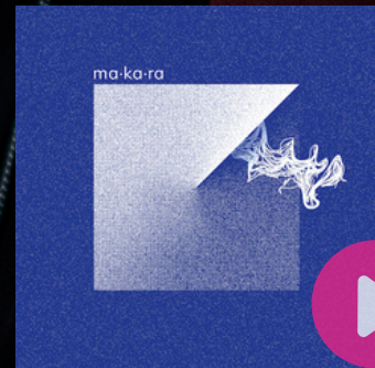
"MAKARA" (piano and coffee records, 2021) 70k+ streams on Spotify