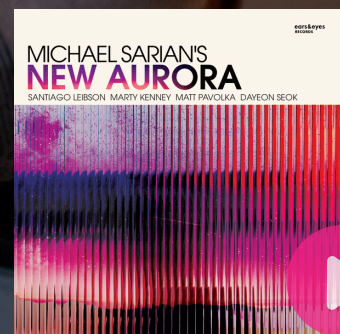
"New Aurora" (ears+eyes Records, 2020)