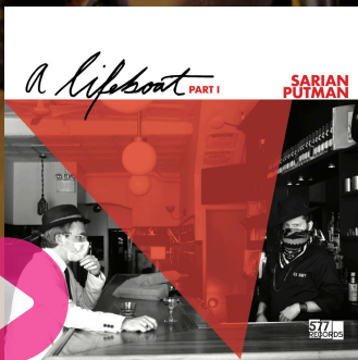
"A Lifeboat (Part I)" (577Records, 2021)